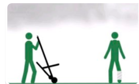
Scan this QR code to view a short film of the Escape-Chair®

There are four models of Escape-Carry Chair® available. General evacuation ranging from your standard chair to an upgraded comfort chair.