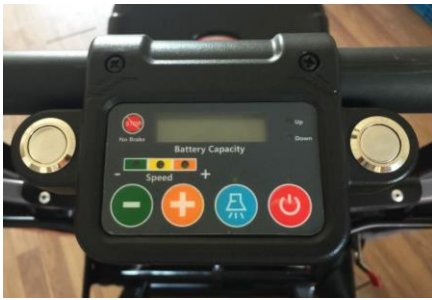
Display control panel