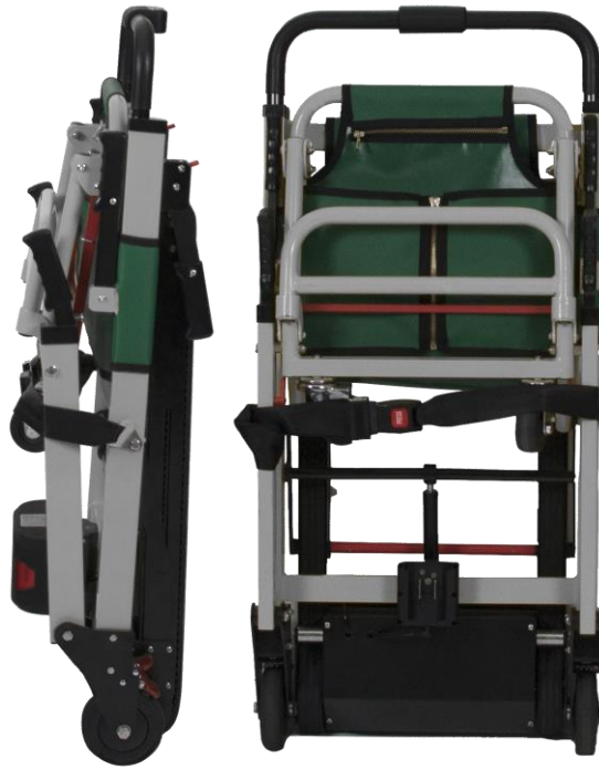
Escape-Chair® VOLT folded