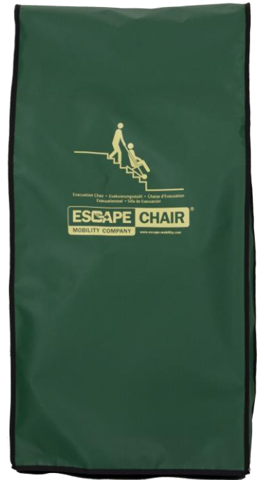
Heat and flame resistant Dust cover